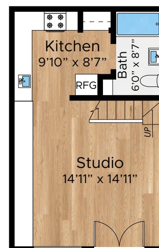
ADU Main Level