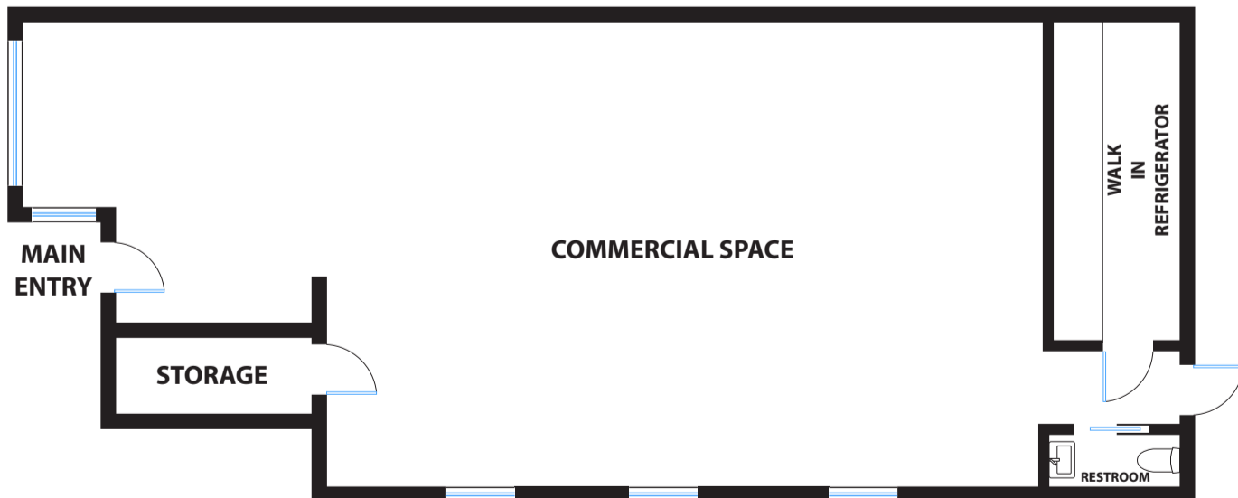
FIRST FLOOR - COMMERCIAL SPACE