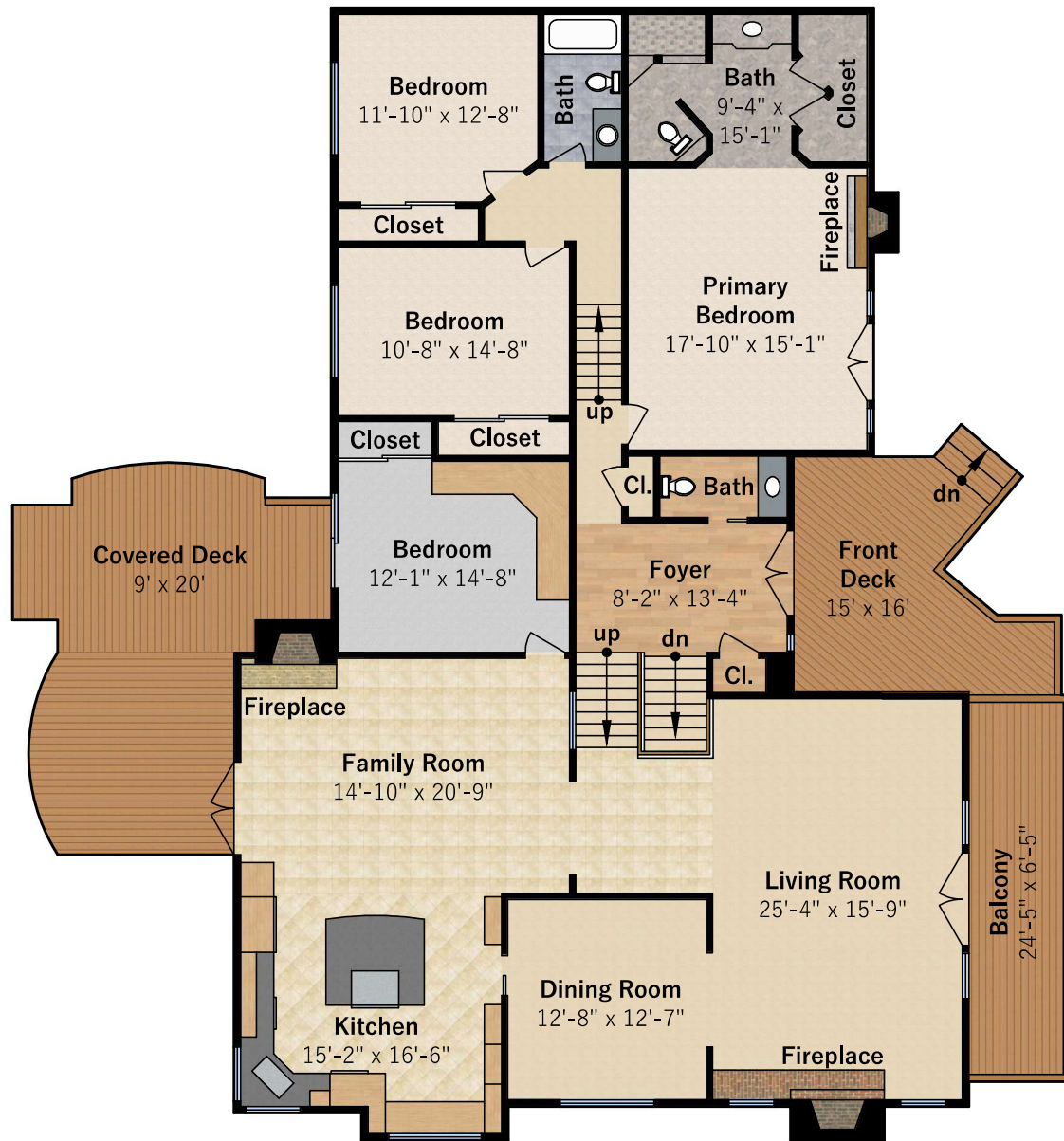
Main Level approx. 2,649 sqft