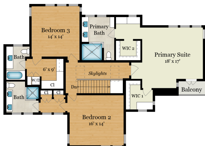
MAIN RESIDENCE UPPER LEVEL 1,570 SQ FT